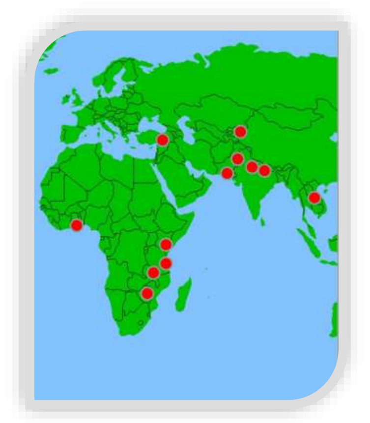
Countries where we work.

We continue to be guided by James 1:27 that commands us to minister to orphans and widows, and James 2:18 that tells us to show our faith through our works (James 2:18).