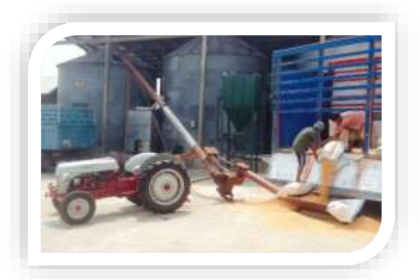
Grain drying and milling center in Laos

We also funded the formatting and printing of Bibles that displayed parallel columns of English and the local language on the same page. These were then distributed and are a great tool for witnessing. They are popular with the locals since they can learn English while studying the Bible, and Americans can use them to learn the local language while sharing the Gospel.