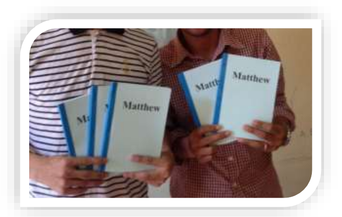
Bibles distributed in Laos

Laos. We continue supporting Business as Mission projects in Laos where we fund grain drying, storage and feed milling projects. The gospel is shared through these projects, and many churches have been planted.