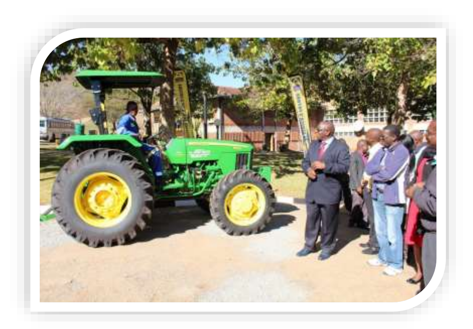
Tractor purchased as Africa University

Administrative expenses remain less than 1% of our total budget. We continue to rely on volunteers to do this work as we have no paid staff.