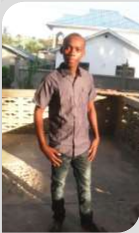
A young Tanzanian student

We continue to partner with Africa University in Zimbabwe, Help to Help ( https://helptohelp.se/en ) and Children in the Wilderness ( http://www.childreninthewilderness.com/ ) to fund students through those organizations. Help to Help is based in Sweden and funds college students in Tanzania.