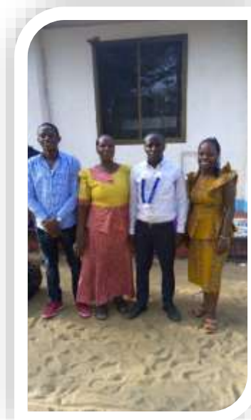
Tanzanian students and our friend that handles our payments

They also coordinate technical training to teach young people a skill such as computer literacy. Children in the Wilderness is based in South Africa and funds students of all ages in South Africa, Malawia, Botswana, Zimbabwe, and Zambia. Each group meets personally with students to encourage and mentor them. We also work through trusted contacts in these countries to make sure money is used wisely and to follow up the progress of each student. We share the love of Christ with them whenever we can, and have online Bible studies with some.