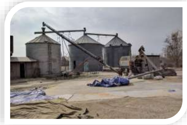
Grain bins from Nebraska that were shipped to Kyrgyzstan

Laos. We were fortunate to be the recipient of a Giving Back Foundation grant from the