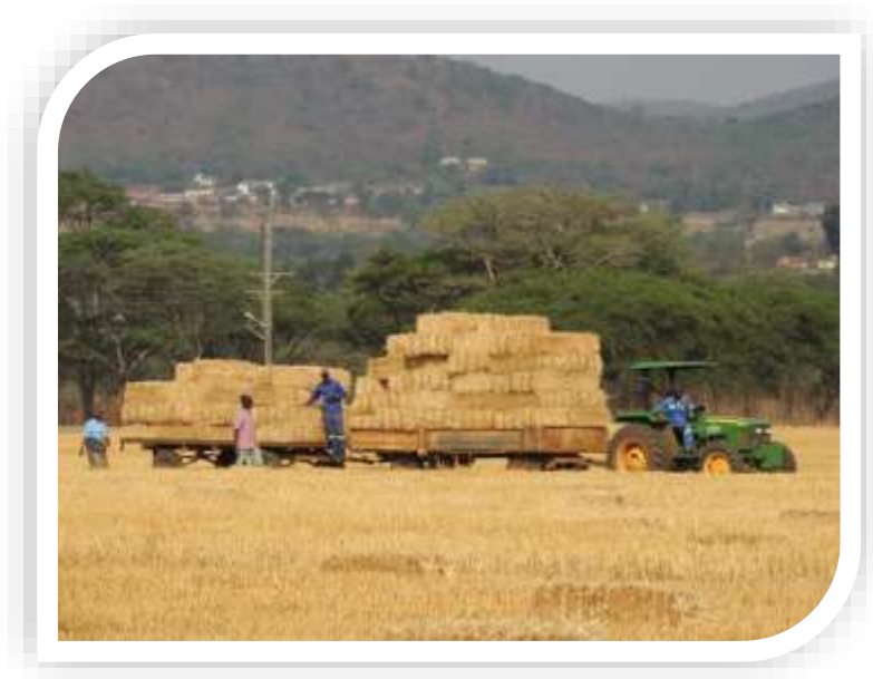
Recent picture of a tractor purchased last year for Africa University

Administrative expenses remain less than 1% of our total budget. We continue to rely on volunteers to do this work as we have no paid staff.