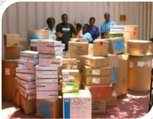
Medications purchased for a clinic in Zimbabwe

Zimbabwe. We continue to support the medical clinic at Eden Children's Village. In the past we have sent medications, but import issues are making this more difficult. Thus, we sent $10,000 so they could source supplies and medications locally. We also collected clothing and other items for a shipment that should leave for Zimbabwe later this year. In addition, we paid a portion of the total container cost. We also donated a tractor to a Business as Mission project that hope to start up there in 2018.