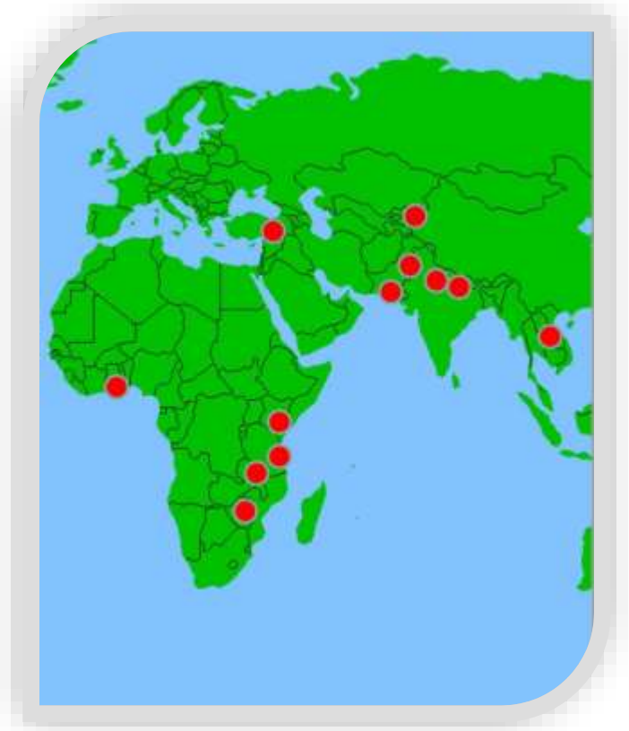
Some of the 17 countries where we have worked

We continue to be guided by James 1:27 that commands us to minister to orphans and widows, and James 2:18 that tells us to show our faith through our works (James 2:18).