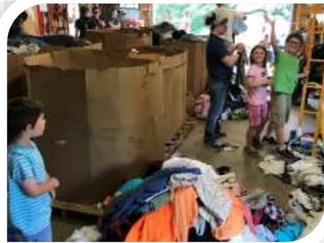
Sorting clothes for a shipment to Zimbabwe

Zimbabwe. We continue to support the medical clinic at Eden Children's Village. In the past we have sent medications, but import issues are making this more difficult. Thus, we sent $10,000 so they could source supplies and medications locally. We also collected clothing and other items for a shipment that should leave for Zimbabwe later this year. In addition, we paid a portion of the total container cost. We also donated a tractor to a Business as Mission project that hope to start up there in 2018.