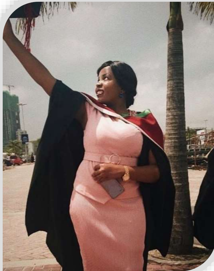
A recent college graduate in Tanzania!

Spreading the Gospel through providing agricultural, educational, and medical support in developing countries.