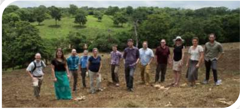
Engineering Ministries International team in Nicaragua