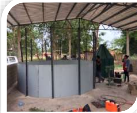
Harvest Center under construction in Laos