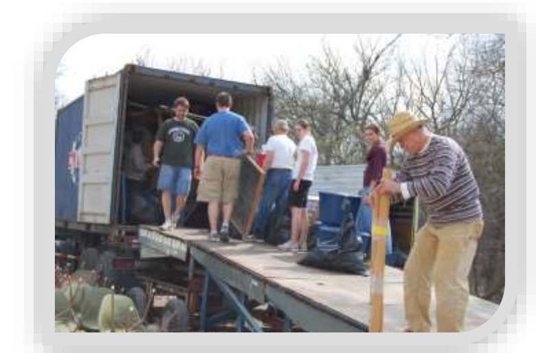
Loading a container in Manhattan, KS