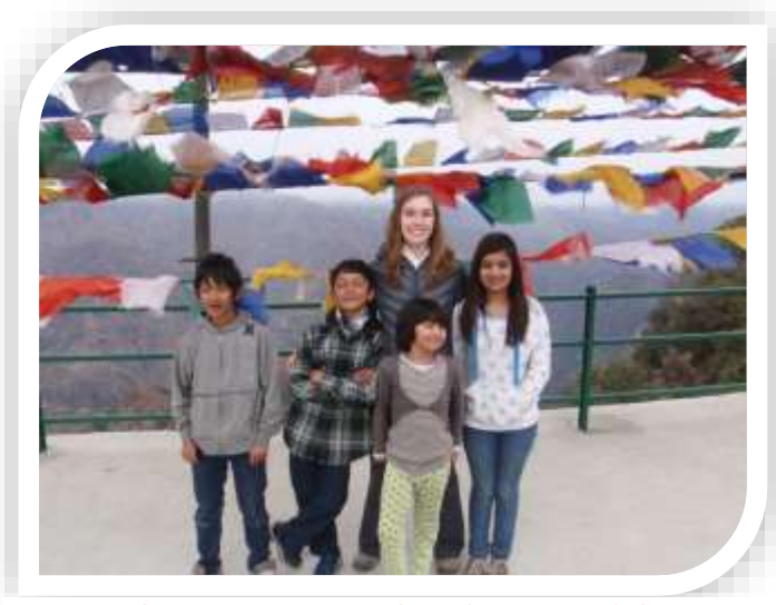
Tibetan monument in India with missionary kids

Zimbabwe . We shipped a 40 ft container of agricultural equipment, medical supplies, orphan gifts, a large generator, and 150,000 Kids-Against-Hunger meals to Eden Children's Village (ECV). We sent funds to ECV to purchase farming inputs. We also traveled to ECV to work in their medical clinic and to set up grain storage to reduce post-harvest losses. Our efforts with this orphanage over the past few years have resulted in their losses to insects and rodents being reduced from over 20% to about 0%. This helps the orphanage be more self-sustaining. ECV supports over 100 orphans and employs over 100 people in the local area. They have baptized over 20 people in the past year.