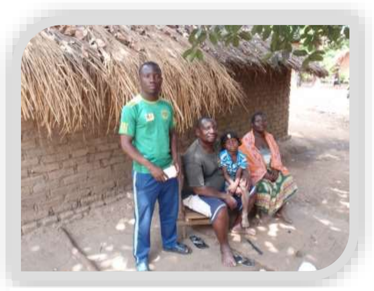
A college student being supported in Tanzania

The first year of Planting Hope International has been amazing, and God has richly blessed this ministry. As a result of generous donations, we were able to provide agricultural, medical, and educational support to the poor in Zimbabwe, Tanzania, Uganda, Laos, Kenya, and India. Our donor base is expanding, and we have received many in-kind donations. We have a good pool of volunteers that help prepare and load containers, with over 60 different people helping on various workdays. We took trips to India,