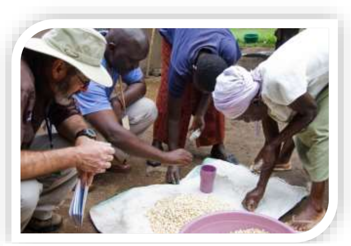
Evaluating grain losses in Kenya