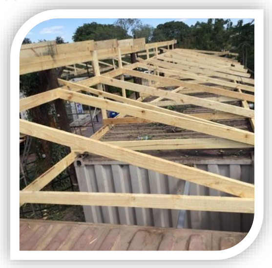
New roof being built over the clinic in Zimbabwe

Education. We have supported over 180 students in countries such as Tanzania, Zimbabwe, Zambia, South Africa, Botswana, Liberia, Kenya, Nepal, and Malawi. Ages range from about 5 years old to college age. We have done this