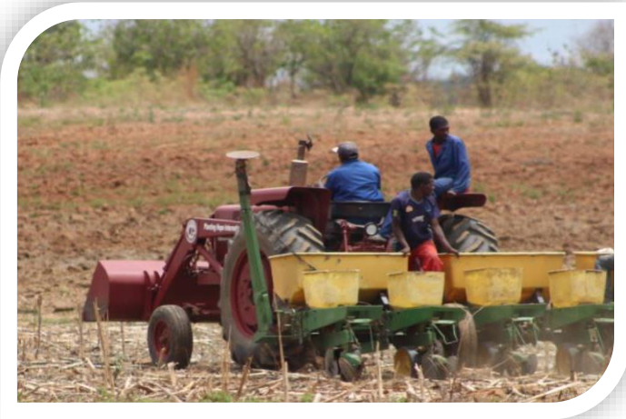
Planting soybeans in Zimbabwe

Agricultural Support. We've had fewer requests for agricultural support in recent years, but we did