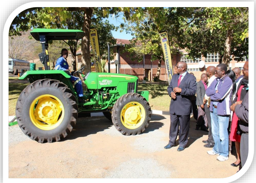
Tractor purchased for Africa University

We are excited to report that we are partnering with Help to Help ( https://helptohelp.se/en ) and Children in the Wilderness ( http://www.childreninthewilderness.com/ ) to fund students through those organizations. Help to Help is based in Sweden and funds college students in Tanzania. They also coordinate technical training to teach young people a skill such as computer literacy. Children in the Wilderness is based in South Africa and funds students of all ages in South Africa, Botswana, Zimbabwe, and Zambia. Each group meets personally with students to encourage and mentor them.