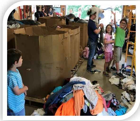
Sorting through 5000 lbs of clothes donated by Howies Recycling for kids in Zimbabwe

We hope to send additional grain handling and storage equipment to Business