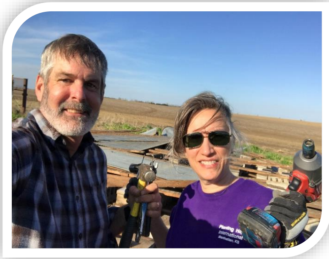
The last day of taking down bins in Nebraska

where Christianity cannot easily be shared. Missionaries share the Gospel with workers through these businesses. Lives are being impacted, churches are being started, and the Gospel is being spread.