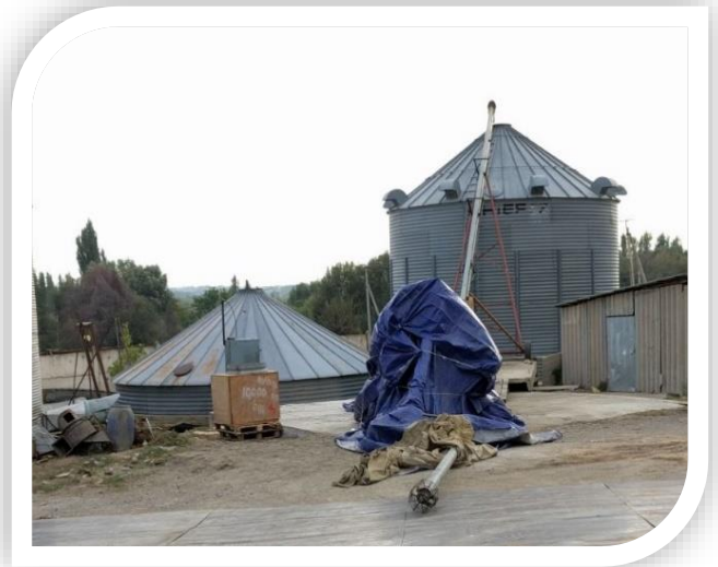
Bins from Nebraska that are now in central Asia

Agricultural projects. We sent a 40ft container of grain storage and handling equipment to a communist country and to a muslim country in Asia. One container arrived for the soybean harvest, and one 10,000 bushel grain bin was assembled and filled with the new harvest! This equipment supports Business as Missions projects in those countries