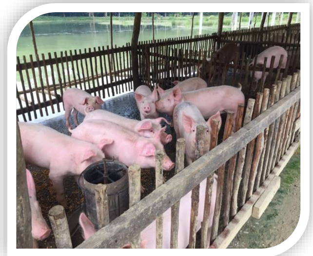
Some of the beneficiaries of the grain storage and feed milling work in Laos.

Agricultural Support. One of our biggest recent efforts is helping Business as Mission grain storage projects in Laos and Kyrgyzstan. It has been encouraging to see how the Laos “Harvest Centers” continue to impact many communities through their work to establish grain drying, storage, and feed-making centers. The bins we sent to Kyrgyzstan last year for a large grain storage and milling facility have been assembled and that work continues to grow. We are also providing analytical testing of their soybeans to help them improve their crops. It was also great to see a tractor we donated to a project in Zimbabwe arrive last month. That was no small feat considering the tough import regulations in that challenging country.