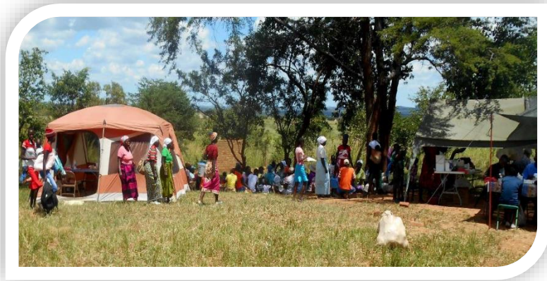
Mobile medical clinic in Zimbabwe.

In another exciting project, we agreed to fund indigenous interns with the Christian agricultural group, ECHO, whose mission is to reduce world hunger through agricultural training for people working in tropical areas. They have training centers in Ft. Meyers, Florida, Tanzania, and Thailand.