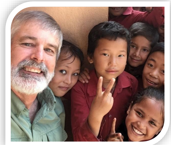
New Nepalese friends!

Donations can be made through our website or mailed to: Planting Hope International 3310 Germann Drive Manhattan, Kansas 66503