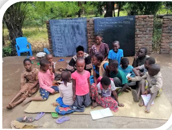
A school for young kids started by one of our recent graduates.

purchase whatever supplies they can get within the country. They see thousands of patients a year and recently started a mobile clinic. They regularly share the Gospel with their patients.