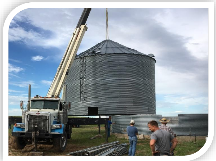
Using a crane to lift a 25,000 bushel grain bin.

We also recently funded the completion of a water system for a village in southern Tanzania. We are careful about supporting water projects since many water projects soon fail or promote a dependency on western money. However, this village had built much of the system already and only needed about the final 30% of the funds. Besides the obvious benefit of having consistent clean water, kids can spend more time at school since they do not have to carry water, teachers will be more likely to stay at the school since they likewise do not have to carry water to the school, and they can proceed with plans to upgrade the local health clinic. We have a long and trusted relationship with the person making this request and feel this is a good use of your donations.