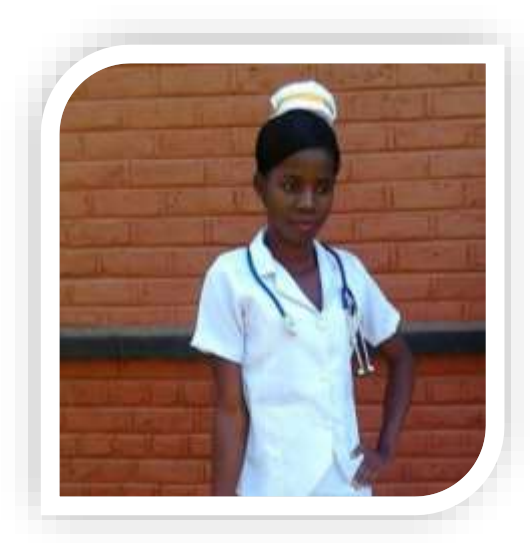
A STUDENT THAT RECENTLY COMPLETED HER NURSING DEGREE IN MALAWI.

Education. We have supported over 200 students in countries such as Tanzania, Zimbabwe, Zambia, South Africa, Botswana, Liberia, Kenya, Nepal, and Malawi. Ages range from about 5 years old to college age. We feel this is an effective way to have a long-term impact in developing countries since these students will likely become leaders in their countries where many are not able to complete school. In addition, we have paid tuition for farmers to attend various agricultural short courses. When selecting students, we give preference to females and children of single mothers as they are the most vulnerable and helpless in many of these locations.