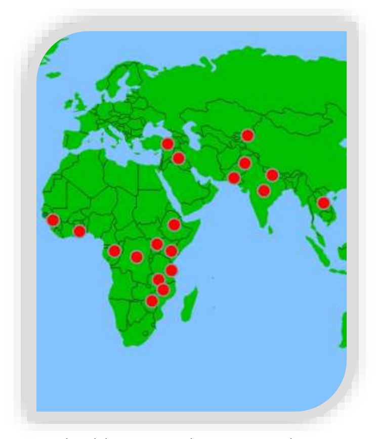
Each red dot corresponds to a country where we have worked.

Our guiding Scripture verses are James 1:27 which commands us to minister to the orphans and widows, and James 2:18 which challenges us to show our faith through our works.