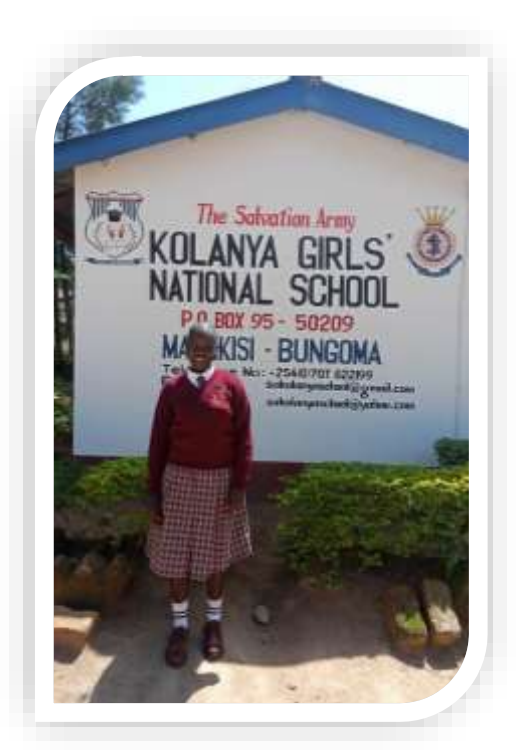
A BRIGHT YOUNG GIRL WE ARE SUPPORTING IN KENYA THROUGH SHESHINES MEMORIAL FOUNDATION.

We also continue to fund indigenous interns with the Christian