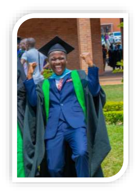
A NEW GRADUATE IN MALAWI THAT WE SUPPORTED THROUGH CHILDREN IN THE WILDERNESS.

Malawi, Botswana, Zimbabwe, and Zambia. Each group meets personally with students to encourage and mentor them. We also work through trusted contacts in these countries to make sure money is used wisely and to monitor the progress of each student.